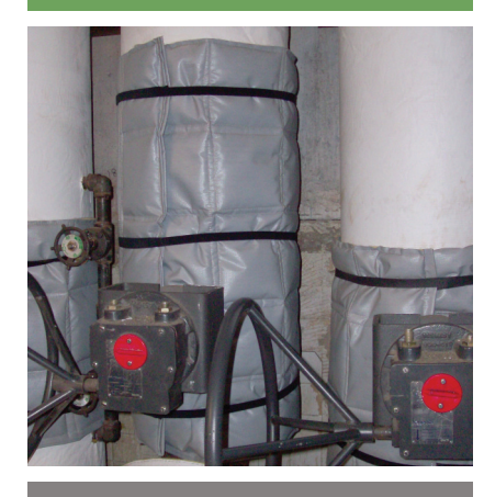
Installs in Less than 15 Minutes