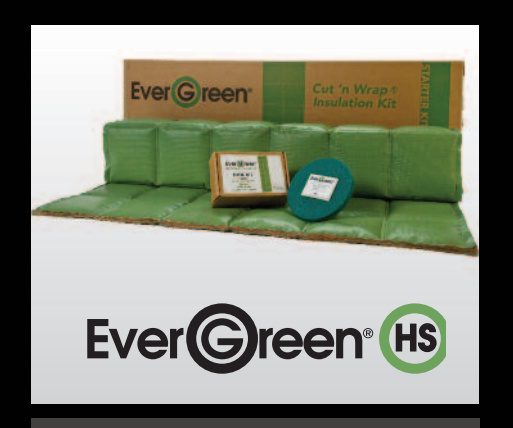
70°F to 500°F For indoor steam and hot water distribution systems