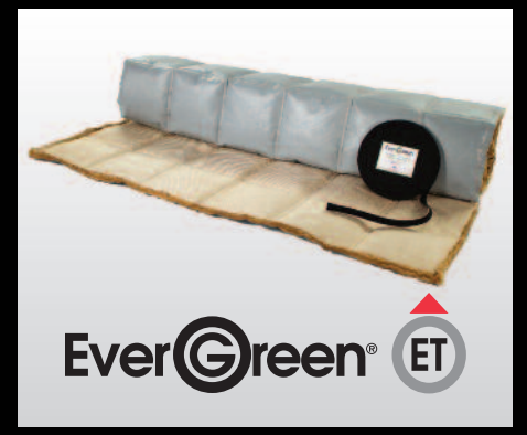
70°F to 700°F For use on steam and process fittings, valves and components