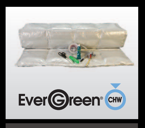
32°F to 250°F Chilled water and dual temperature systems from 32°F to 250°F