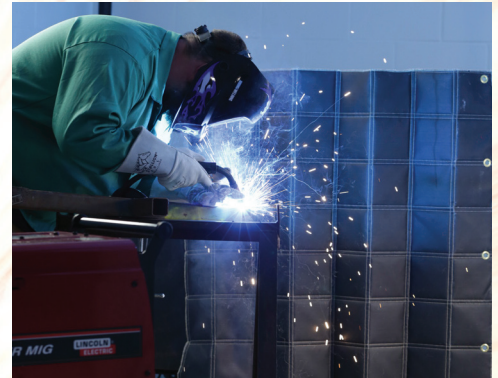
Can be used as a self-standing welding screen