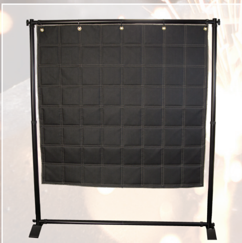
Available with grommets for hanging